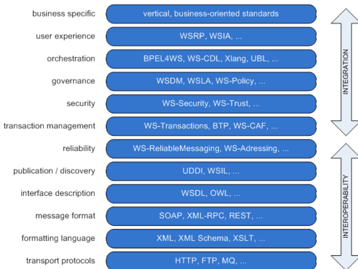
Figure 6.6: Service Oriented Architecture stack

The most important open standards that can be recommended for this model are: