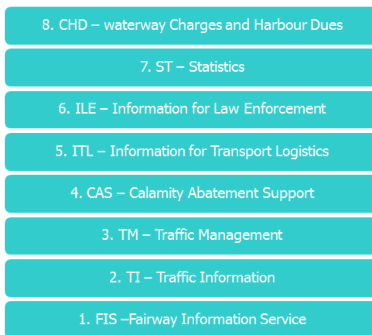
Figure 6.1: RIS services

The RIS services, as defined in Chapter 5 and their relation with the RIS key technologies (see Figure 5.1), can be seen as a layered model similar to that presented in Figure 6.1. The implementation of RIS should contain a least Fairway Information Services and in the next step it can be extended with traffic information, then with traffic management as the primary services. Based on these three primary services the other services can be implemented.